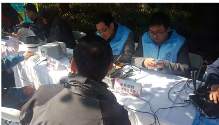
3.5 Learning Lei Feng to participate in Changing District Cohesion Association activities